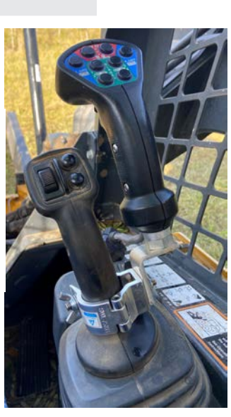
Standard Wireless Remote