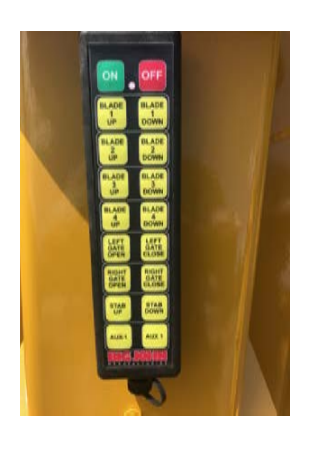
Standard Wireless Remote