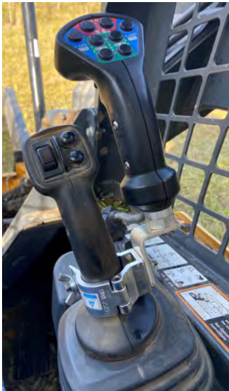
Standard Wireless Remote