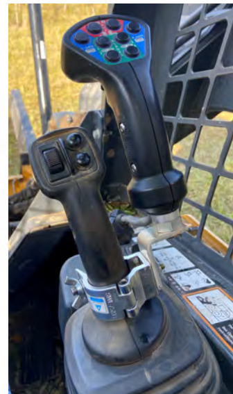
Standard Wireless Remote